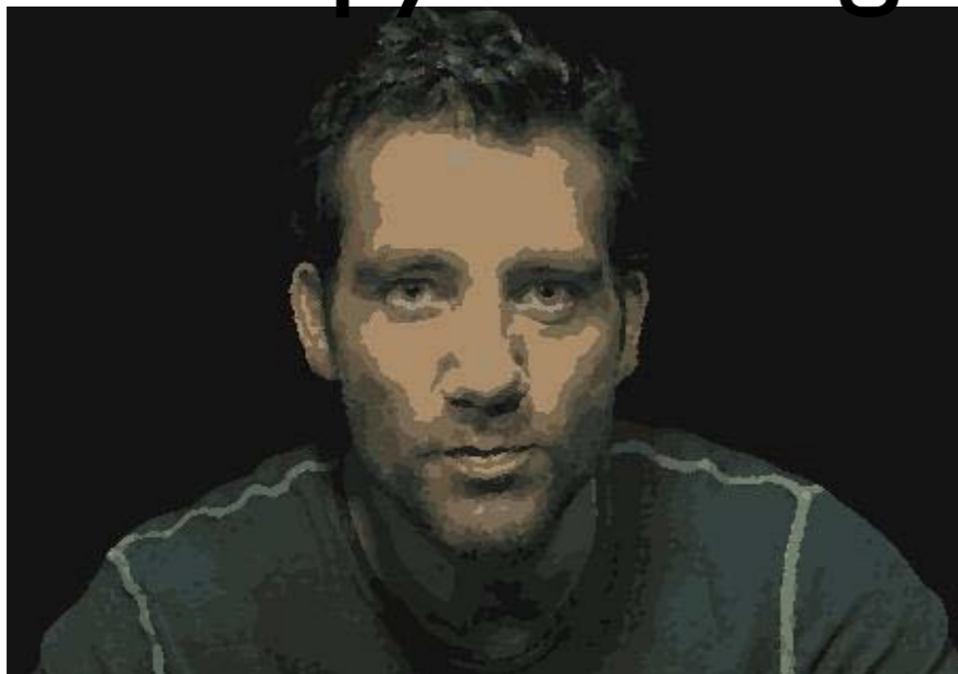
Image Segmentation via Entropy Coding